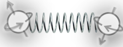
FIG. 1. In HvH theory, two quantum spins can become entangled while only interacting indirectly via a classical oscillator as the mediator.

In this paper, we consider entanglement via a classical mediator in the framework of Hybrid van Hove (HvH) mechanics [10, 11] and carry out detailed calculations for a relatively simple system of two spins, or qubits, that interact via a classical oscillator, see Fig. 1. The theory is formulated in Hilbert space, and, as we explicitly show, it allows for entanglement via a classical mediator. This result contradicts various no-go theorems in the literature, indicating that some of the assumptions of these theorems are too restrictive and, in some cases, may be even inconsistent with any formulation of classical mechanics in Hilbert space that incorporates one of its most defin-